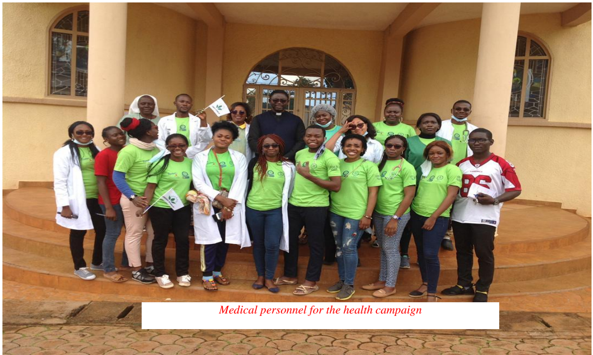
Medical personnel for the health campaign