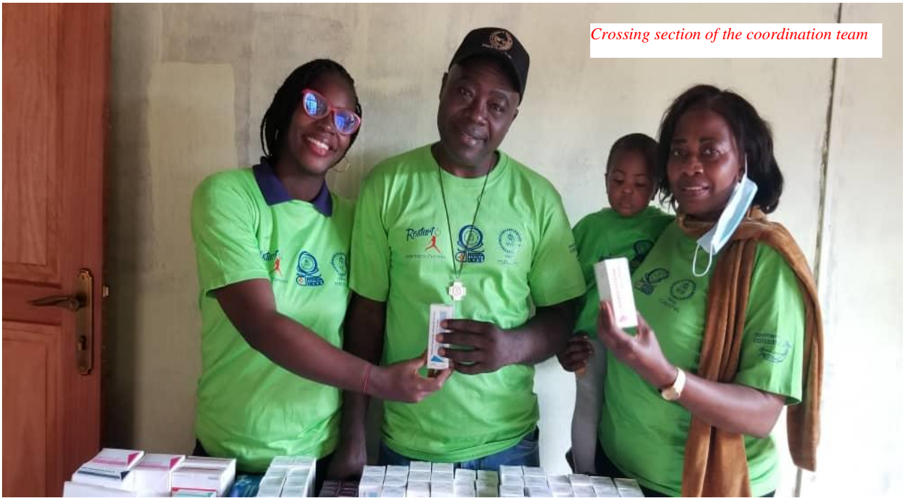
Crossing section of the coordination team