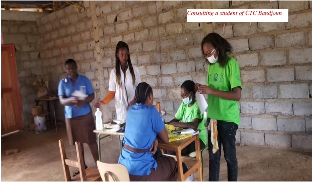
Consulting a student of CTC Bandjoun